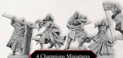
4 Champions Miniatures