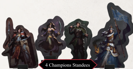
4 Champions Standees